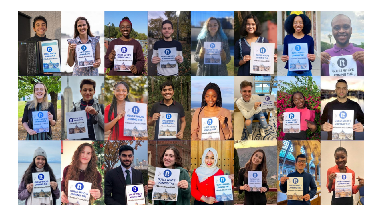
The Rhodes Trust is delighted to announce its Class of 2022 Rhodes Scholars-Elect, who will arrive at the University of Oxford in autumn 2022.

What does the Rhodes Scholarship cover? The Rhodes Scholarship covers University of Oxford (and College) fees as well as providing an annual stipend for living expenses and accommodations for two years in the first instance. The University of Oxford is a collegiate research university in Oxford, England.