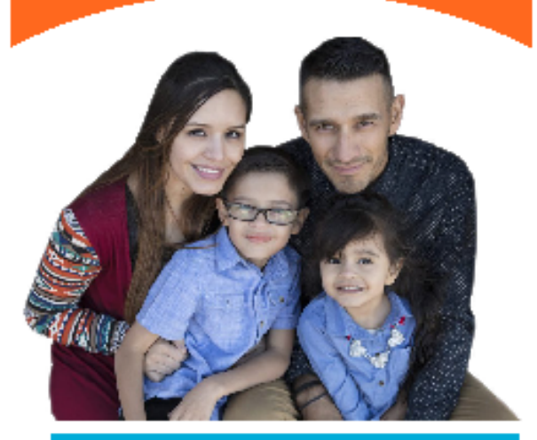
Take the first step! View homes and apply at HFH.org