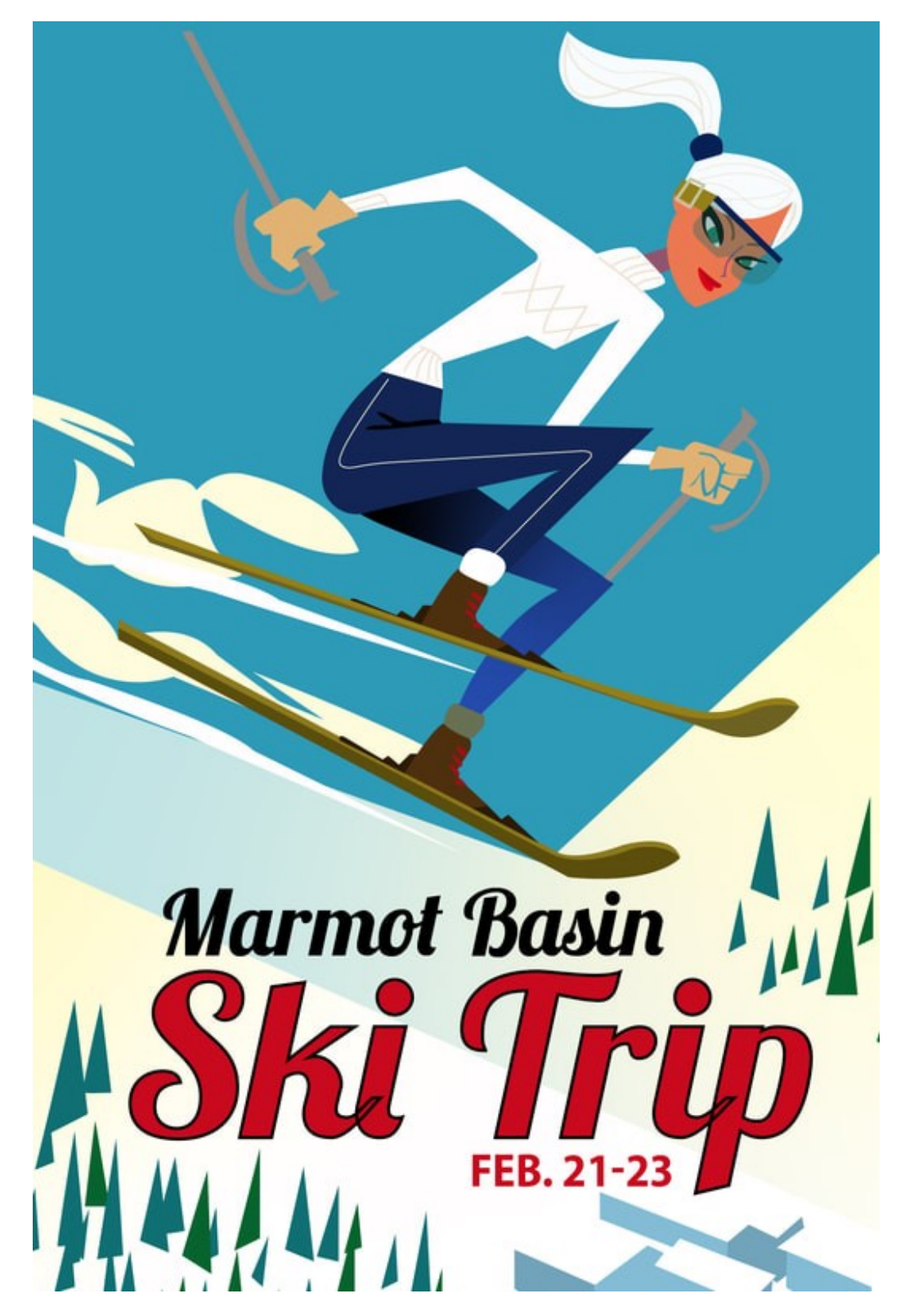
LOOKING FOR A WEEKEND GET-AWAY IN THE MOUNTAINS?

This is an awesome trip for both skiers and non-skiers! February 21-23rd Concordia is heading to Jasper to shred up Marmot Basin. This is a fantastic way to make new friends, re-connect with old ones, and explore Canada's beautiful mountains.