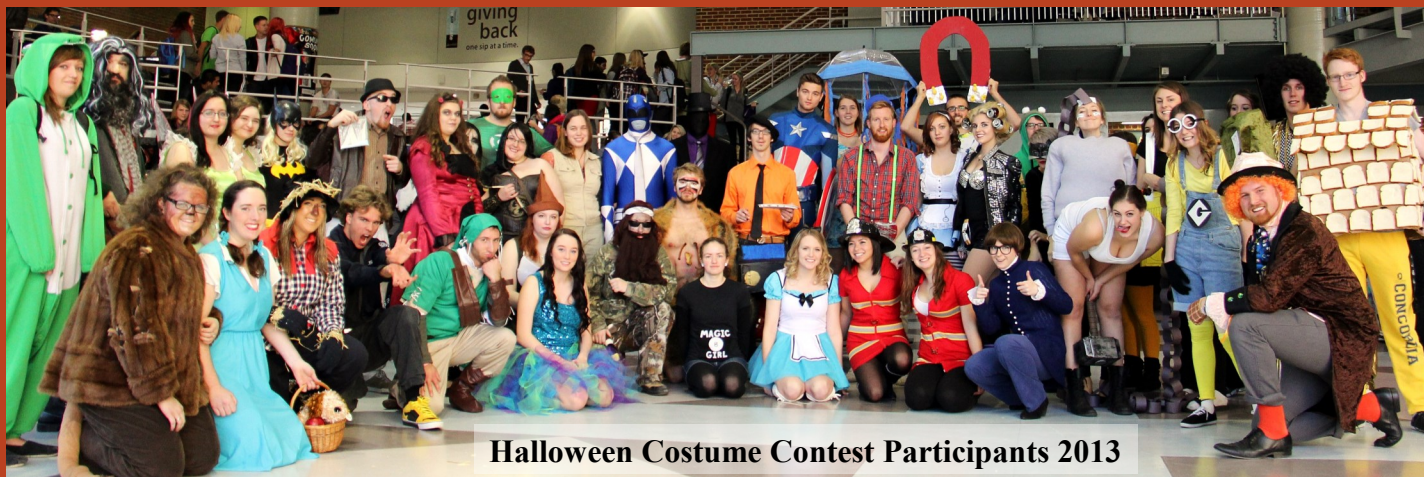
Halloween Costume Contest Participants 2013